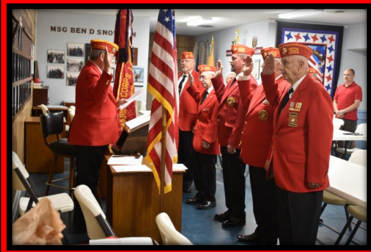
2021 Elected Officers Taking Oath