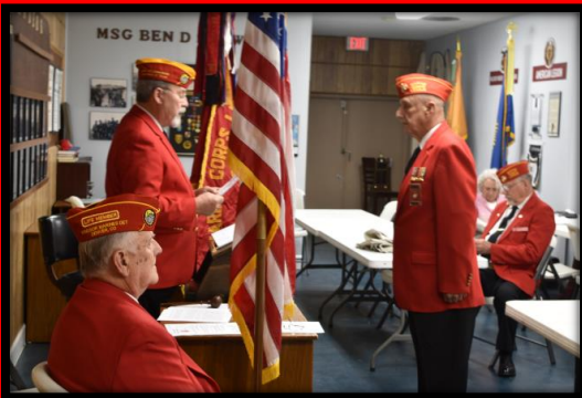
2021 Commandant Taking Oath