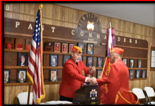
2021 Commandant Receiving Gavel