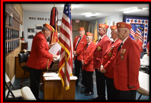
2021 Elected Officers