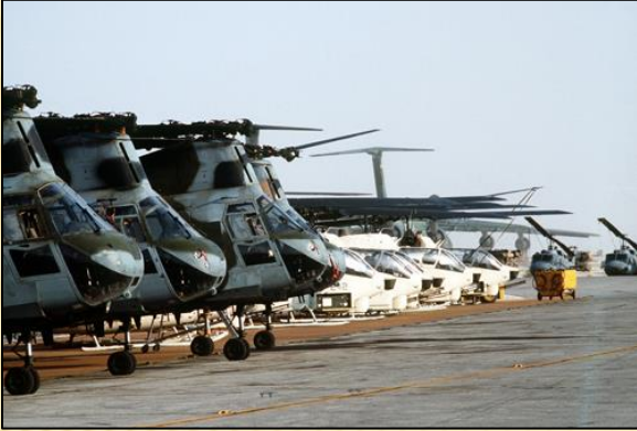
*Image info: Four Marine Corps CH-46E Sea Knight helicopters, foreground, and six AH-1 Sea Cobra helicopters sit on the flight line at Landing Zone 32 Site Alpha during Operation Desert Shield, January 1991. (U.S. Government photo/released).