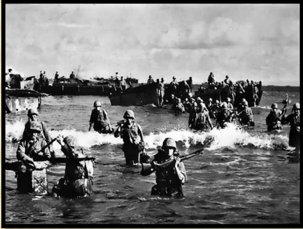
*Image info: Marines wading ashore on Tinian.