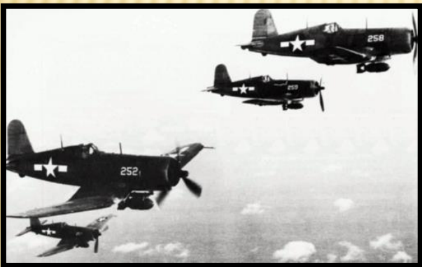
*Image info: Four U.S. Marine Corps Vought F4U-1 fighters armed with bombs in late 1943 or early 1944.

The combination of surprise, heavy preassault bombardment, and effective logistical support resulted in significantly fewer casualties (344 killed and 1550 wounded) than were experienced in previous landings during the Corps' Pacific Campaign. As a result, the assault on Tinian was coined "the perfect amphibious operation of World War II."