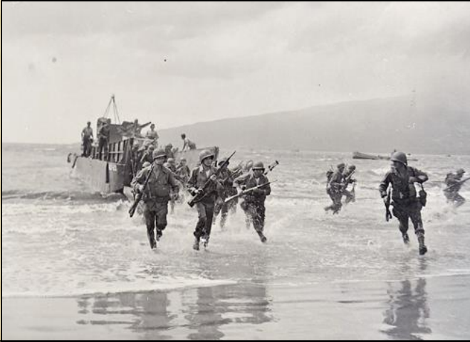
Marine Raiders in Operation at Makin Island, 1943.

Marine Raiders Strike Makin Island On August 17, 1942, the 2nd Marine Raider Battalion under Lieutenant Colonel Evans F. Carlson landed on Makin Island.