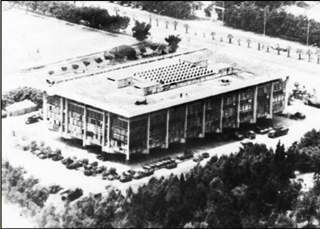
The Marine barracks building in Beirut, Lebanon. (USMC photo Courtesy of II MEF/released).