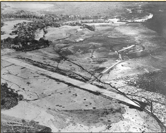
*Image info: Aerial view of Henderson Field, Guadalcanal, Solomon Islands, April 11, 1943. (U.S. Navy photo/released).

On August 7, 1990, President George H.W. Bush ordered U.S. military troops and aircraft to Saudi Arabia as part of a multinational force to defend that nation against possible Iraqi invasion. The following week, the Marine Corps announced that it had committed 45,000 Marines to the Persian Gulf area as a part of Operation Desert Shield, which would become the largest deployment of U.S. forces since the Vietnam War.