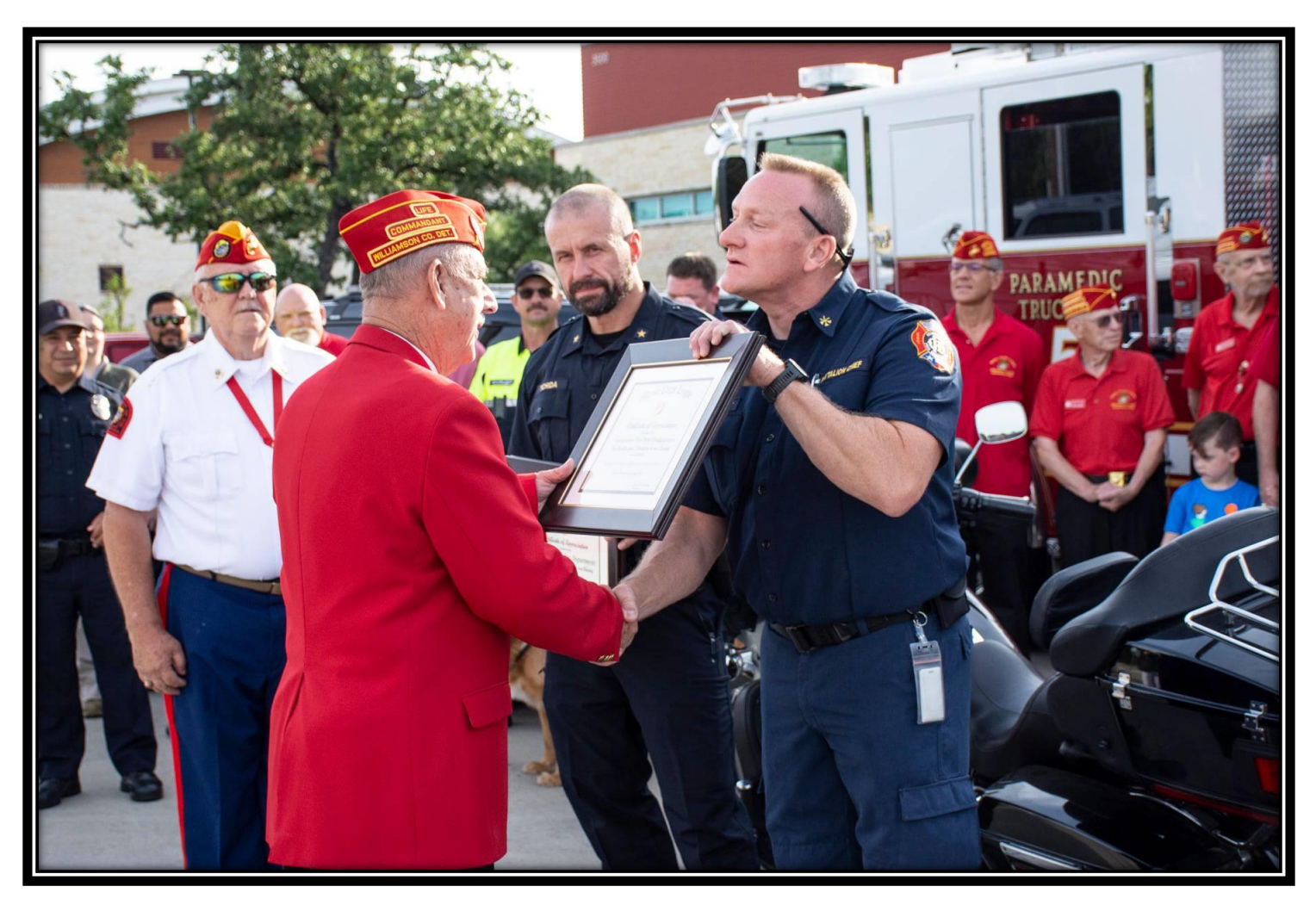
Sir, can you speak up a little, I can't hear you, Sir!