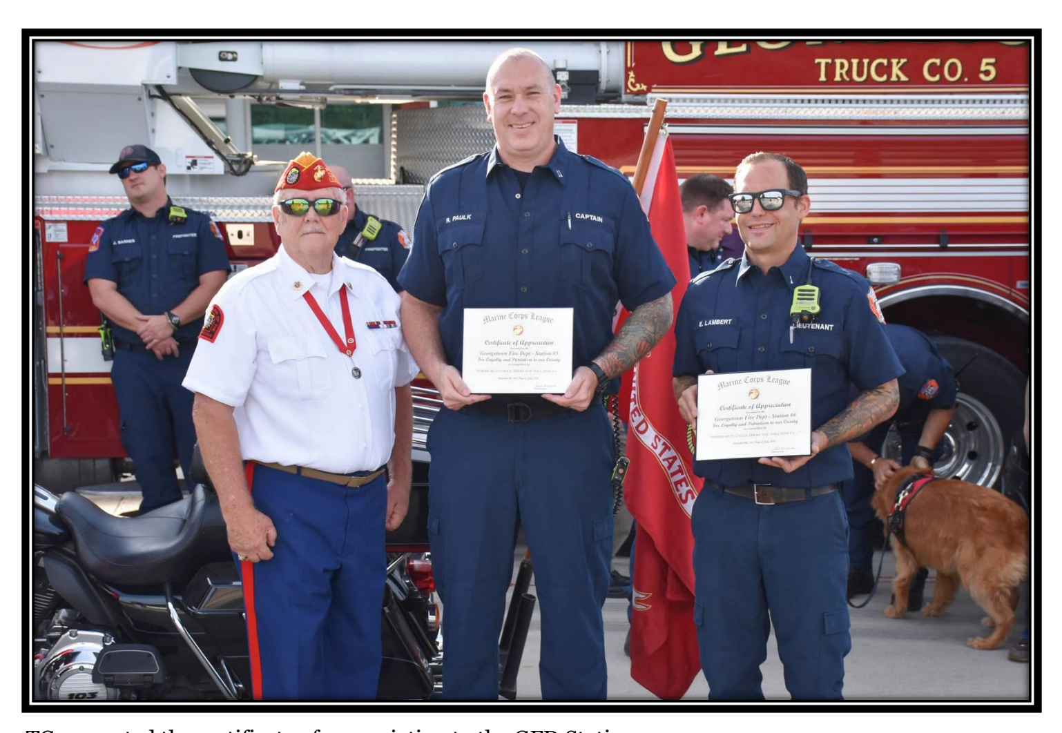
TC presented the certificate of appreciation to the GFD Stations 1 - 7