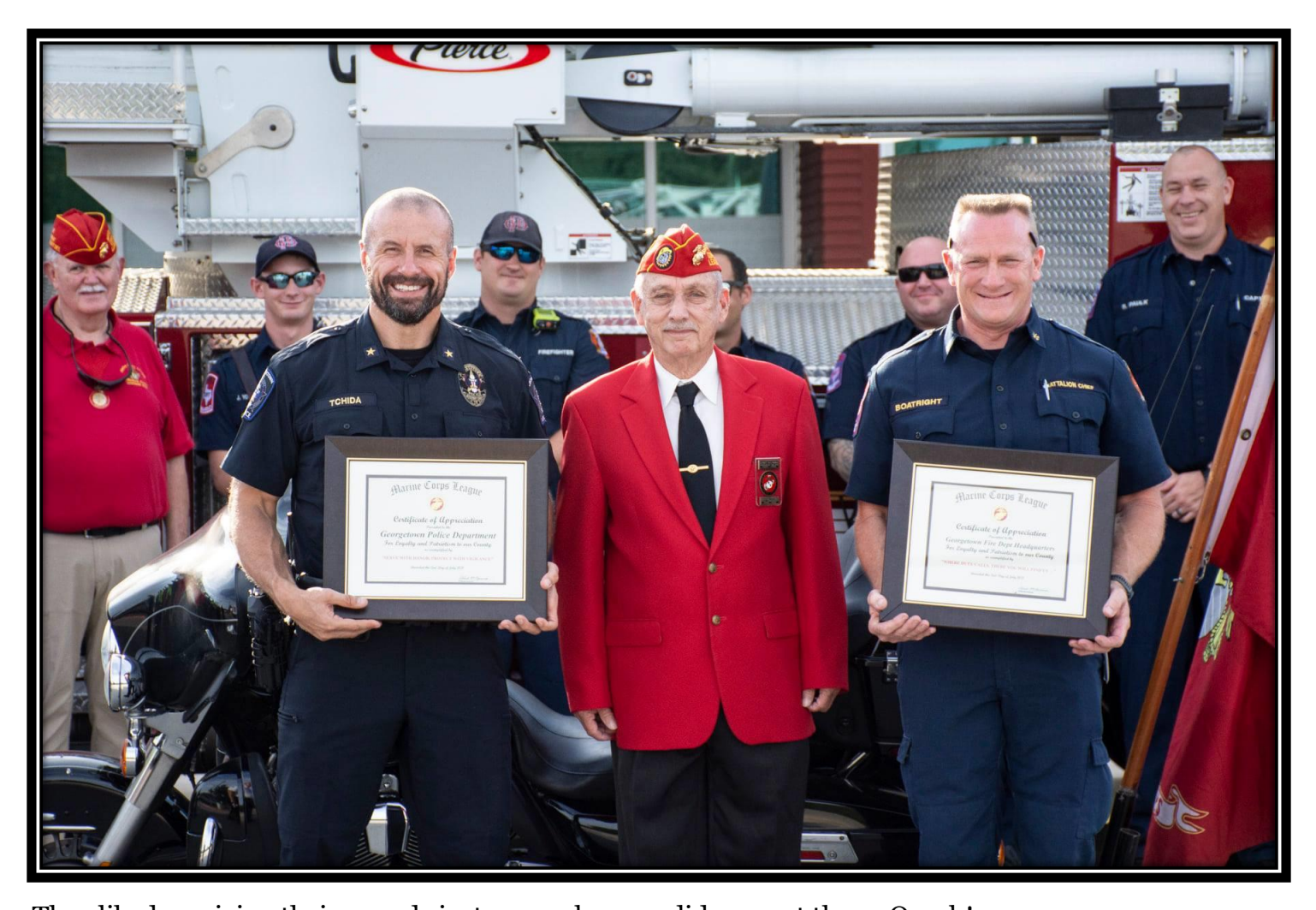
They liked receiving their awards just as much as we did present them. Oorah!